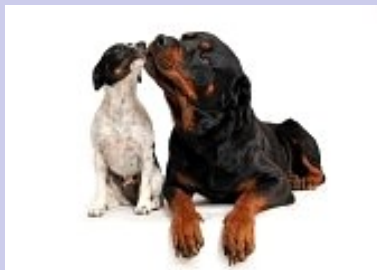
Best Friends For Life

Your pets may be more of a liability to you than you realize. In fact, many dog breeds are specifically excluded from traditional homeowners policies. That means that anything from digging and playful nips to injurious bites or even provoked attacks could easily leave you vulnerable to a devastating lawsuit. Did you know that 4.7 million dog bites happen every year—making dog-related damage the biggest cause of homeowner's insurance claims? As a result, many insurance companies are limiting dog bite insurance coverage or excluding animal liability coverage altogether. With increasingly strict state and local regulations being enforced across the country, animal liability and dog bite insurance coverage are things that every dog owner should consider.