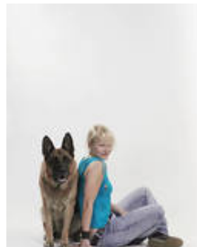
You don't have to lose your best friend.

Counties and states across the country are describing dogs with a bite history as dangerous or vicious. They are requiring owners of these dogs to carry dog bite liability insurance in order to keep their best friend. If you have a dog that has been determined dangerous or vicious, contact the Pet Protection Pak team today.