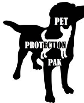
Pet Protection Pak